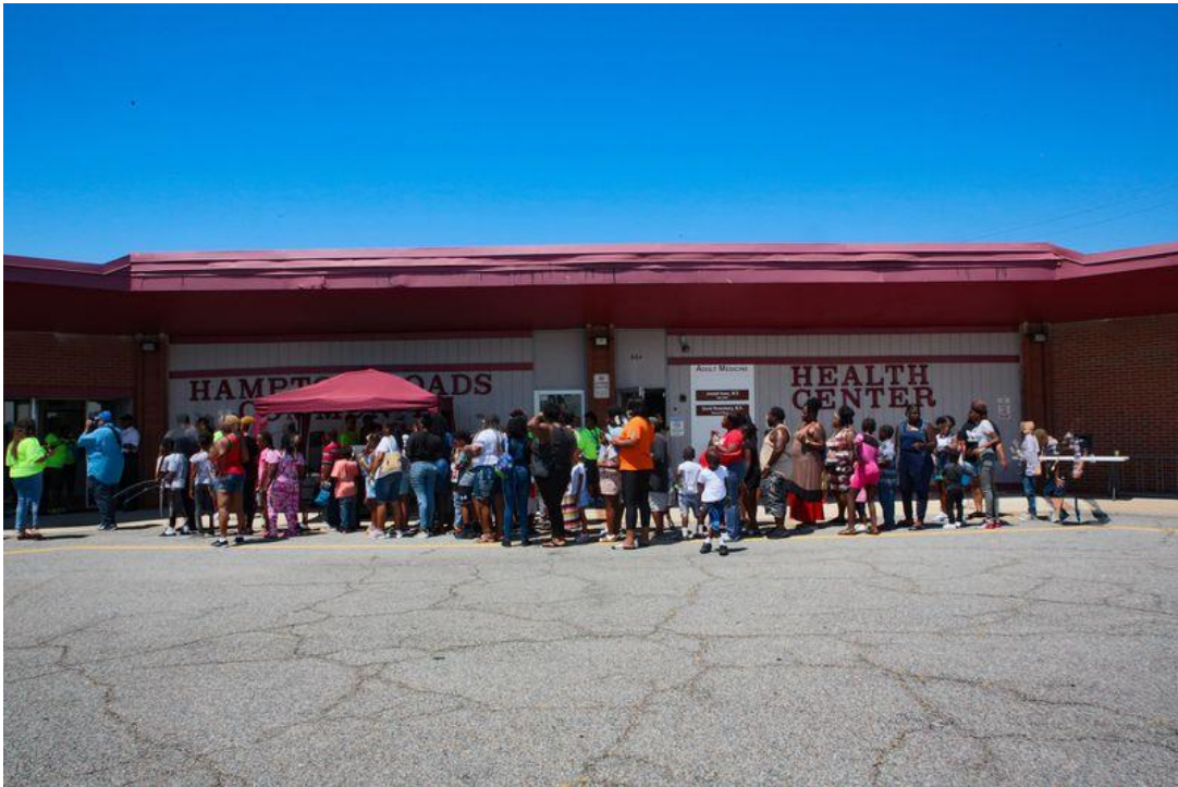
Hampton Roads Community Health Center puts on an annual health fair, which provides a fun atmosphere, free health screenings for children, food, fun, and back to school supplies.