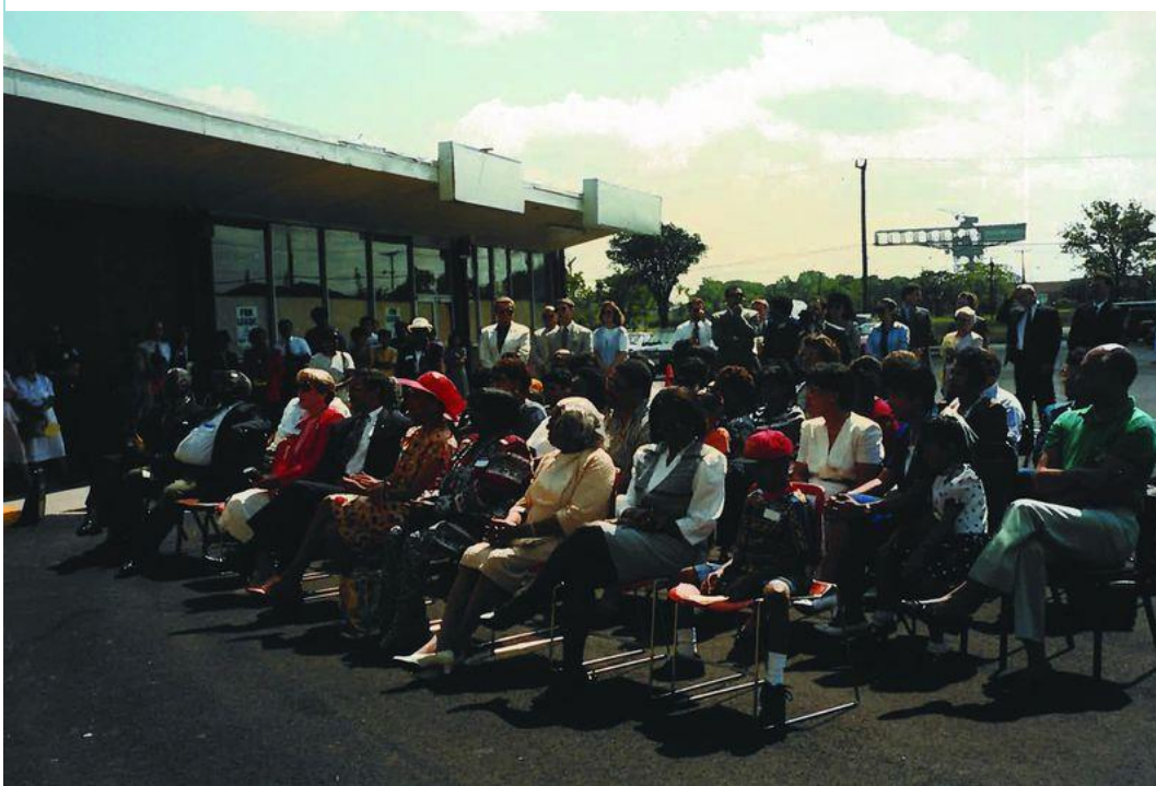
Hampton Roads Community Health Center opened with a ribbon-cutting ceremony in May 1995.