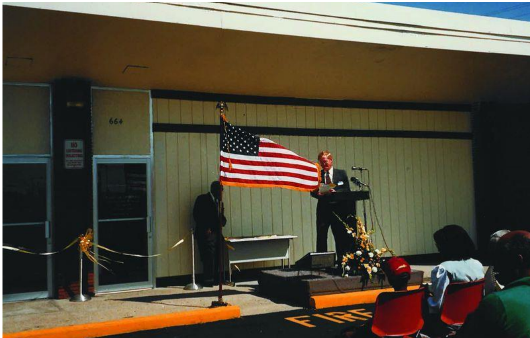
Hampton Roads Community Health Center opened with a ribbon-cutting ceremony in May 1995.