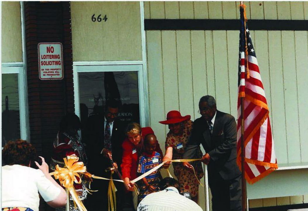
Hampton Roads Community Health Center opened with a ribbon-cutting ceremony in May 1995.